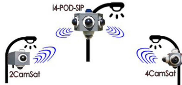
Satellite PODs wirelessly connect and record to IP POD's hard drive.

The i2IP , i4SIP , and the i4PIP PODs are IP based portable systems that can add smaller satellite camera PODs that connect and record back to it wirelessly. A Satellite POD System can have up to 16 cameras.